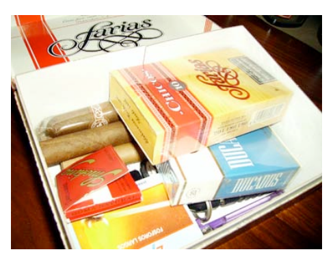
Answer to question no. 14.

The image of the bedroom is one of the most similar answers among the group participants.