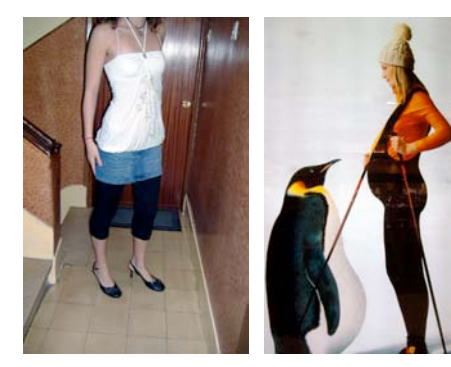
Answer to questions nos. 11 & 18.