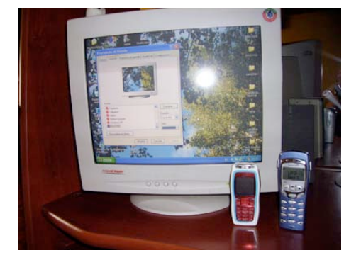
Answer to question no. 15.