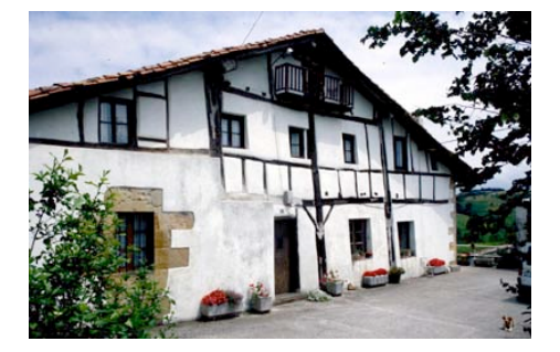
Answer to question no. 20.

Collaboration regarding the magazine and its nature were defined as a hobby, this issue being put to the readers. The reader must associate the images published with four different questions whose answers identified most with the cutting edge leaders who attended the workshop sessions.