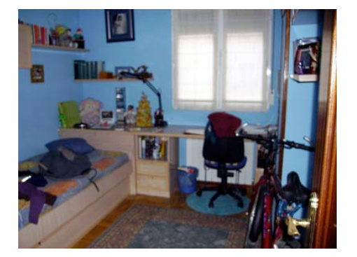
Answer to question no. 01.