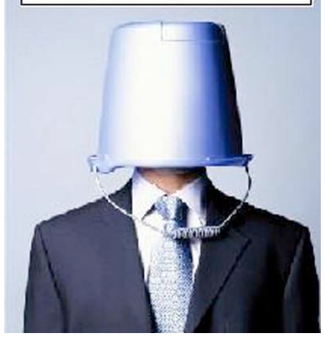
Answer to question no. 13.